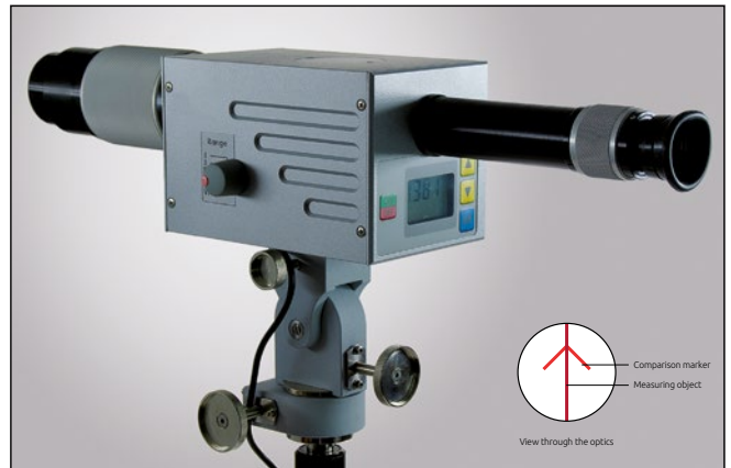
Fig. 3 Intensity comparison pyrometer PV 11 for precise visual temperature measurement.

emissivity tends to increase with temperature, this comparison measurement should always be performed at higher temperatures