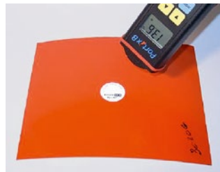
Fig. 2 Determine emissivity by comparison measurement on emission adhesive tape with defined emissivity.

First, the true object temperature is determined at the sticker spot (Fig. 2). Then a comparison measurement is performed at the object right next to the sticker. Subsequently, the pyrometer's emissivity is adjusted so that the instrument displays the prior temperature reading. Because the influence of