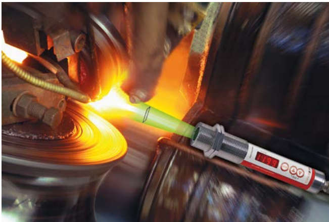
Fig. 1 A two-colour pyrometer with rectangular measuring field precisely measures the temperature even with an oscillating wire.

bances. Even with a degree of weakening of 90 % a two-colour pyrometer still delivers safe and correct measured values. A special feature of non-contact temperature measurement is the influence of the surface, i.e. the emissivity of the workpiece. For example, if the emissivity changes between 70 % and 80 % with an object temperature of 900 °C, the measured value display of a spectral pyrometer varies by approx. 17 °C. A two-colour pyrometer reacts to this much less sensitive.