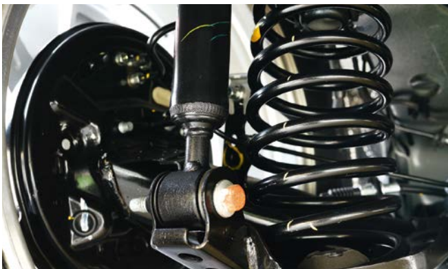
Fig. 2 Tempering of chassis springs requires precise temperature measurement to ensure reproducible production conditions.

Especially with thinner wires and rods in the magnitude of the measuring surface of the pyrometer, the correct alignment and focusing of the instrument is necessary to avoid optical measuring errors. Two-colour pyrometers also offer considerably higher process reliability in this respect, since optical influences have less effect in the measuring process compared to a spectral pyrometer. At measuring positions where the wire oscillates, two-colour pyrometers with a rectangular measuring field are now available. The wire may move freely within the measuring field ( Fig. 1 ).